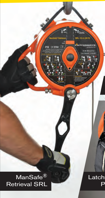
ManSafe® Retrieval SRL