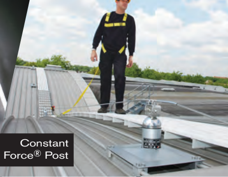
Constant Force® Post