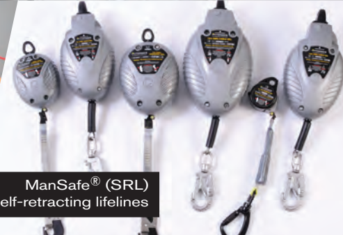
ManSafe® (SRL) Self-retracting lifelines