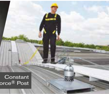
Constant Force® Post