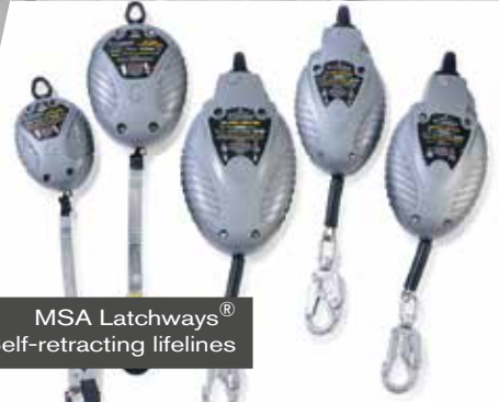
MSA Latchways® Self-retracting lifelines

MSA's range of Latchways fall protection offers the complete solution for your work at height requirements. The MSA Latchways range provides high performance, durable systems for use during construction, operations and maintenance — ensuring the safety of your operatives when working at height, even in the harshest environments.