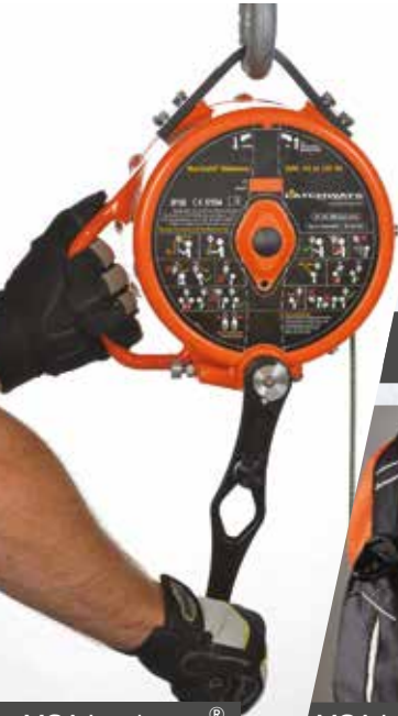
MSA Latchways® Retrieval SRL