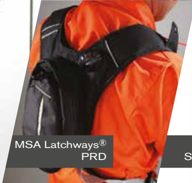
MSA Latchways® PRD