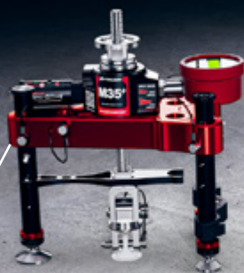
OPTIONAL MEDIUM BRIDGE