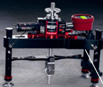
OPTIONAL LARGE BRIDGE