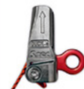
T02 L Duck R Rope Access Back-Up Device