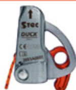
T04 L DUCK Rope Access Back-Up Device