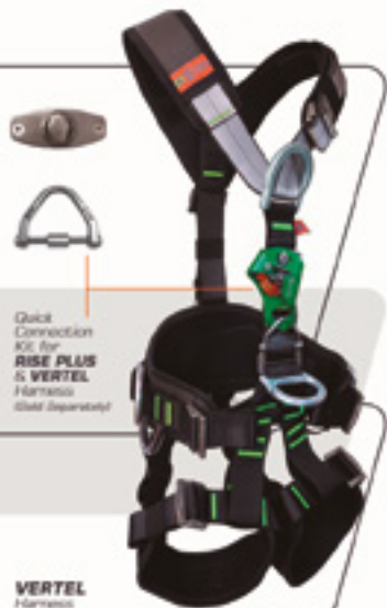
Quick Connection Kit (KIC) for RISE PLUS & VERTEL Harness (Sold Separately)