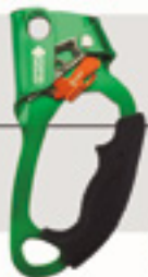
RISE Hand Ascender