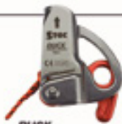
DUCK Back-Up Device