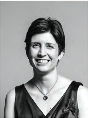
Alison Thewliss MP for Glasgow Central

Alison Thewliss was elected to serve the people of Glasgow Central in May 2015. She is the SNP Spokesperson for Cities in the House of Commons. Prior to her election as an MP, she served as Glasgow Councillor for the Calton Ward in the East End.